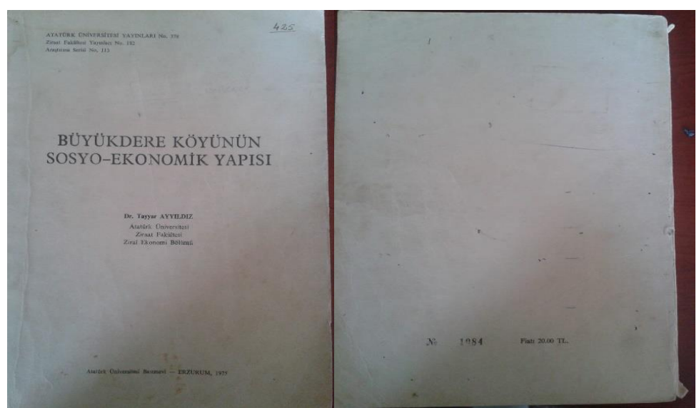
Picture 1. The Front and Rear Cover of the Book "Socio-Economic Structure of Büyükdere Village"

Appendix 2. Map Showing the Location of Erzurum within the Borders of Turkey, and the Location of Büyükdere within the Borders of Erzurum.